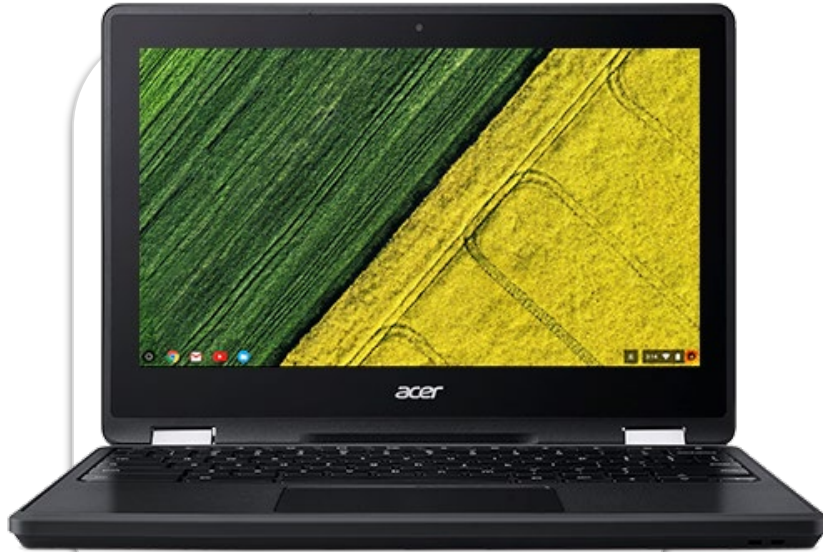
Acer Chromebook Spin R752TN-C1MT