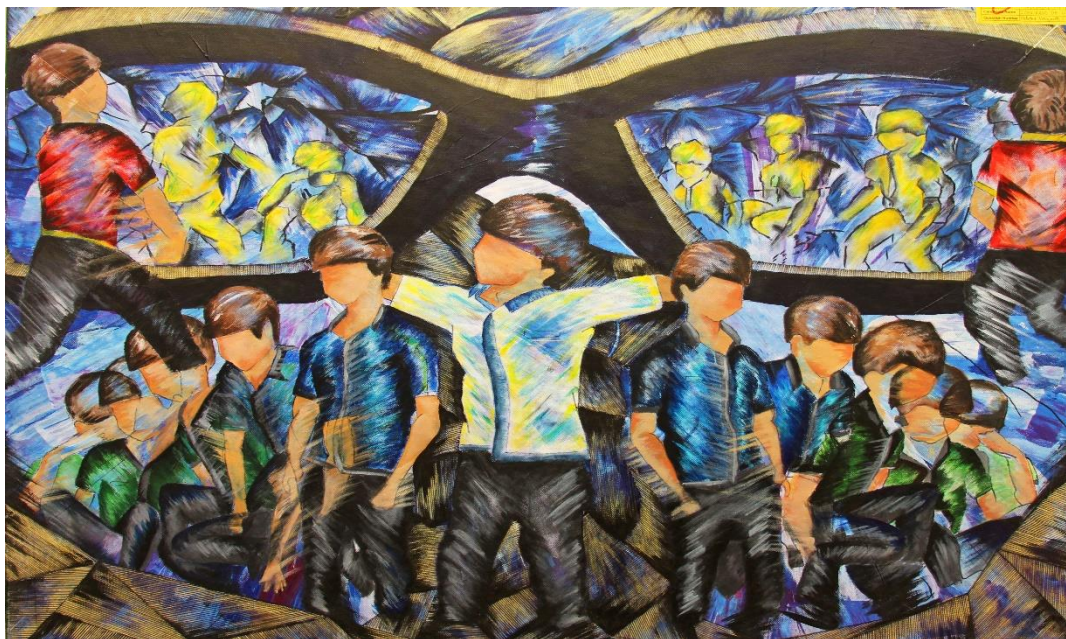
Some of our students' artworks depicting the well-rounded education that TPSS strives to provide for our students.